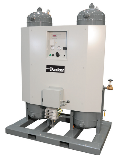
Pressure Swing Adsorption (PSA) nitrogen generators use a Carbon Molecular Sieve (CMS) material inside a vessel that contains pressurized air to draw off the nitrogen molecules.

On-demand nitrogen generators are typically free standing, housed in a cabinet or skid mounted, depending on the application. Users need only connect a standard compressed air line to the inlet of the generator and connect the outlet to the nitrogen line. Standard features often include high efficiency coalescing prefilters with automatic drains and sterile grade afterfilters.