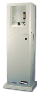
Membrane nitrogen generators use a separation technology made up of polymer fibers that act like a membrane.

Nitrogen makes up about 78% of the air we breathe and there are several ways to obtain a supply of the gas. Options include receiving nitrogen as a gas in large cylinders; as a liquid in micro-bulk tanks, large tanks or dewars; generated on site by cryogenic plants; or generated on-demand in the facility itself.