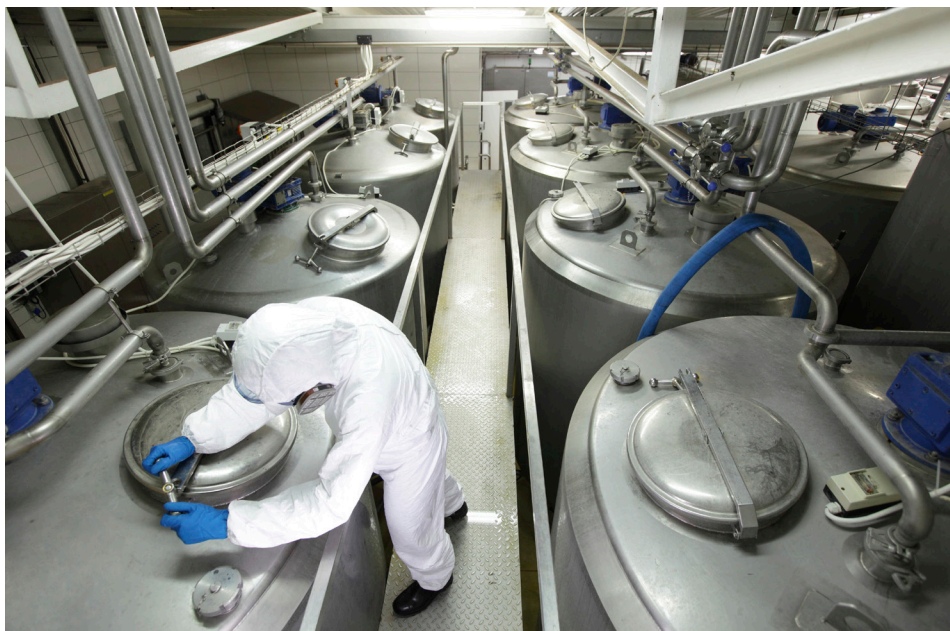
Large tanks such as these are used to store chemicals such as methanol, acetone and benzene and foodstuffs like wine and edible oils.

Process control managers often overlook the potential for chemical tank blanketing to improve facility productivity and safety. In tank blanketing, a low-pressure flow of nitrogen gas (typically less than a few psig) with purities of between 95% to 99.9% is introduced above the liquid level of the chemical to fill the vapor space at the top of the tank with a dry, inert gas. On closed tanks, this creates a slight positive pressure in the tank. Nitrogen is the most commonly used gas because it is widely available and